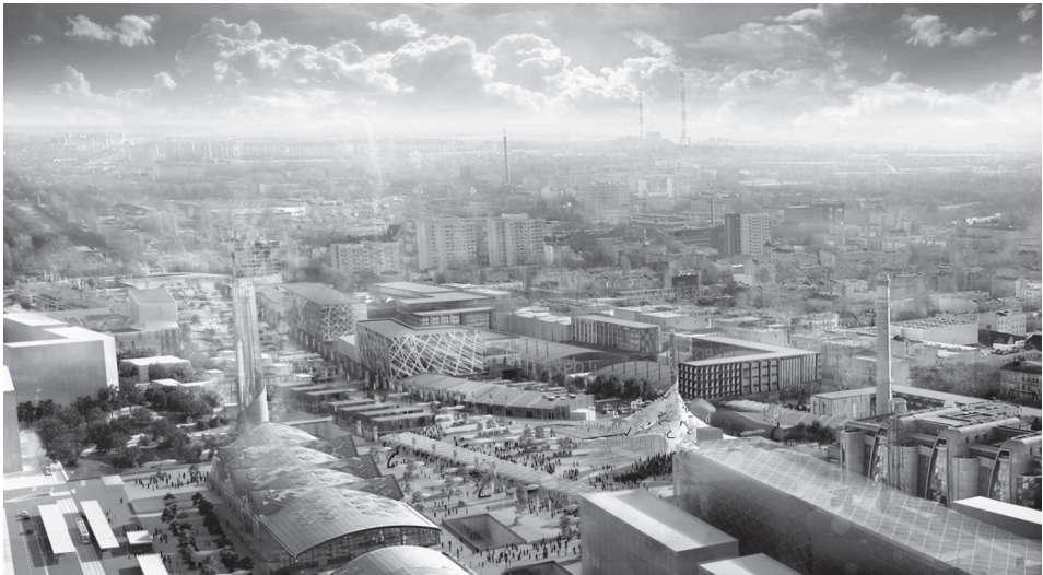
Figure 3. Exhibition area management concept. A train station perspective. The Expo 2022 Feasibility Study materials

a challenge to the designers. Locating the Expo in the NCL will make the area more attractive and facilitate its urbanization. However, the inhabitants will have to put up with the temporary closure of the central quarters. As the experience of previous undertakings of the kind shows, fencing the event area for its duration, that is three months, is highly advisable. However, the Expo in Lodz is not limited to the exhibition. A large number of additional events will also take place. The immediate vicinity of ul. Piotrkowska makes it easy for guests to visit. This awakened curiosity will undoubtedly benefit the local economy which today is in dire need of new stimuli for development. The Secretary General of BIE stresses that “participation in an Expo offers opportunities for economic cooperation and provides an ideal framework to promote local identity” (Loscertales 2010).