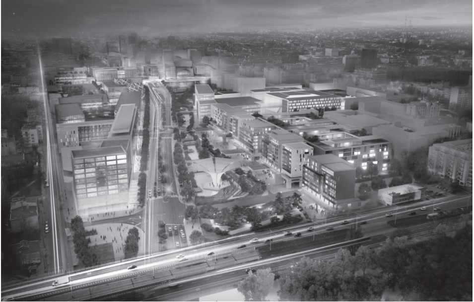
Figure 4. Future Expo area – composition axis perspective. The Expo 2022 feasibility study materials