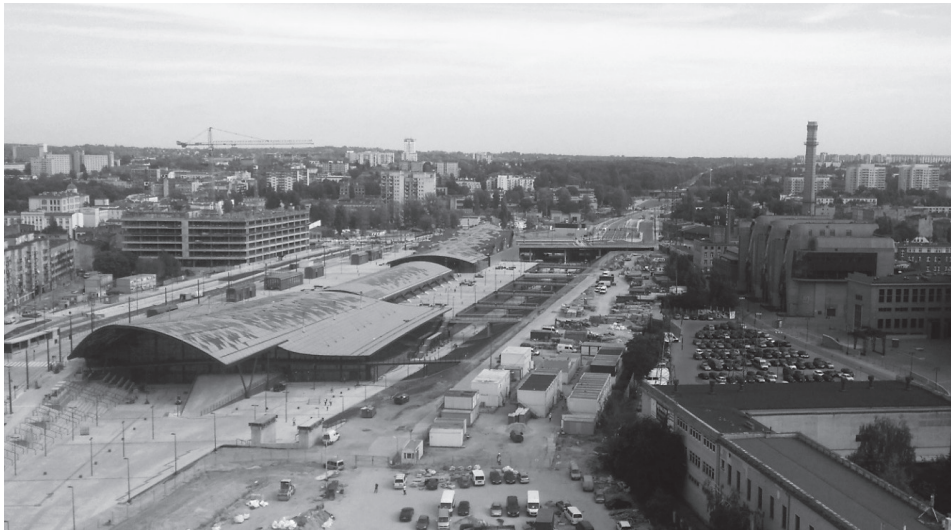
Figure 2. The NCL, the Lodz Fabryczna station and part of the EC1 complex perspective

In the context of Expo 2022, one may wonder how the full potential of the exhibition may be better developed. A multimodal interchange hub serving 200 thousand passengers per day is an excellent answer to the transportation needs of the exhibi-