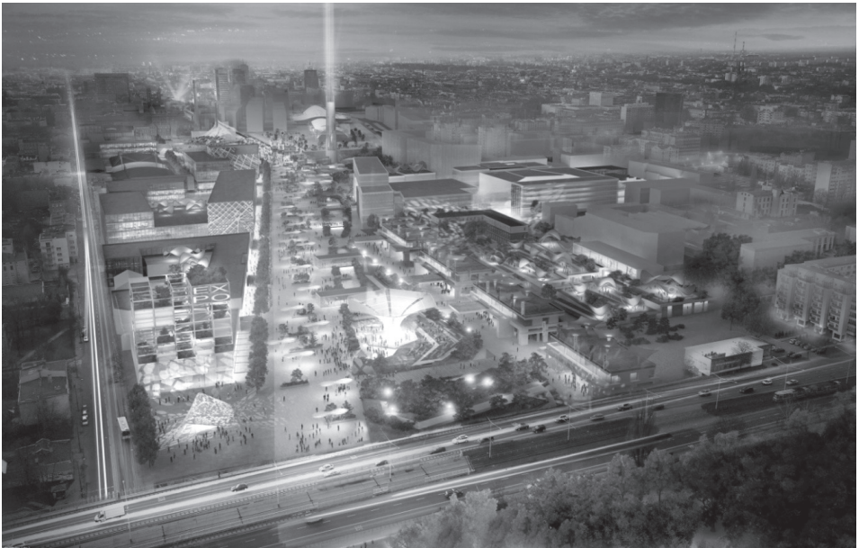
Figure 5. Post-Expo area – composition axis perspective. The Expo 2022 feasibility study materials