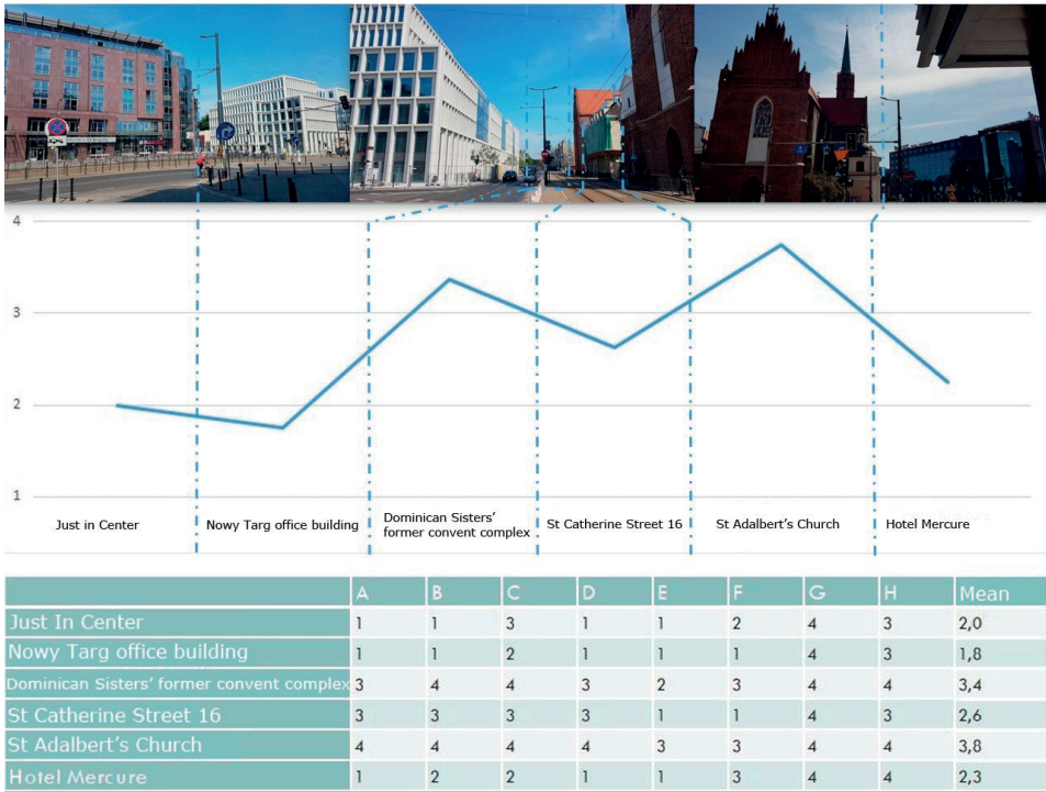
Picture 2. Dominikański Square – the northern panorama (original study)

including mostly office spaces. No visible historical spaces have survived there and although in the past, one of the main city gates – Oławska Gate (a new office building owned by PZU was named after it) was located in this area, its remains are not presented in any visible way to the average space user. The enclosed graph shows certain relationships. In its center, there is a visible growth in the point score, but moving towards its edges, the axes decrease to increase again. In this case, the panorama shows a big differentiation among the adjacent buildings in relation to the identity indicator. In the background, one can see the silhouette of St Maurice's Church and nearby buildings but because of the distance they are of no importance to this study.