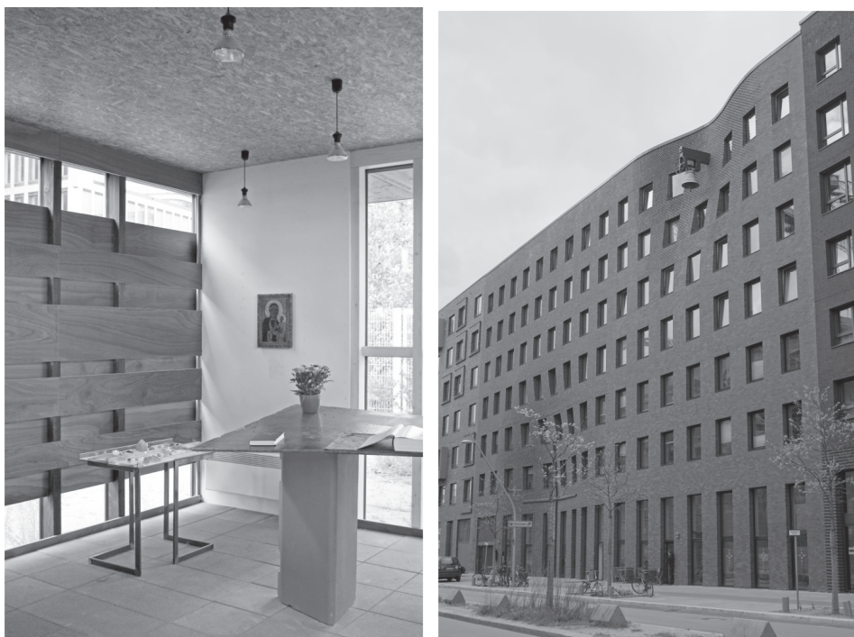
Figure 6. On the left: the temporary chapel in Hafencity – a view from the interior, August, 2010. on the right: The Ecumenical Forum with a separate ecumenical chapel on the ground floor, May, 2016.