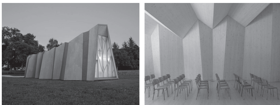
Figure 3. The temporary chapel for the Deaconesses of St-Loup. On the left: a view to the opening on the façade; on the right: a view from the inside.

terpretation of the traditional religious space. This facility is in peaceful harmony with its environment 9 .