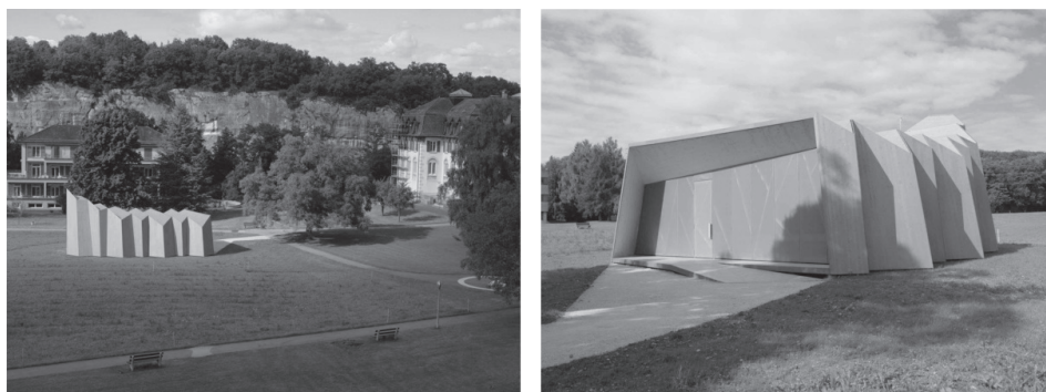
Figure 2. Exterior of the temporary chapel for the Deaconesses of St-Loup, Switzerland. On the left: The shape of the chapel resembles origami; on the right: a view of the entrance to the chapel.